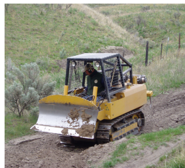
Your registration dollars at work : Trail Ranger / Cat program building and maintaining trail