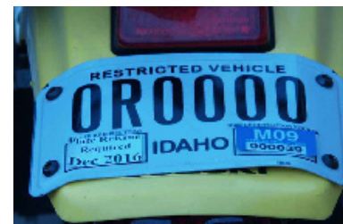
Sticker must be affixed to the restricted vehicle license plate.