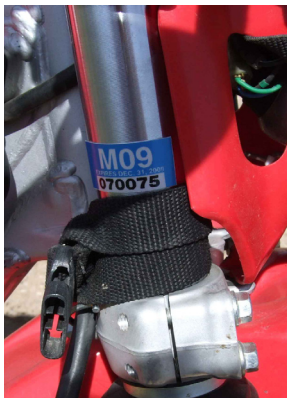
Placement of the IDPR OHV registration sticker for off-highway use:

The IDPR OHV registration sticker requirement doesn't apply to vehicles that are only used for agricultural or snow plowing purposes. If you use your motorbike, ATV or UTV for hunting or recreational purposes, it must have a valid IDPR OHV registration sticker.