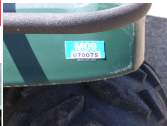
ATV and UTV upon the rear fender.